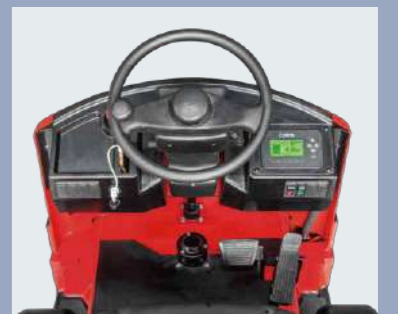
Modern outline design with LCD instrument and USB charging port