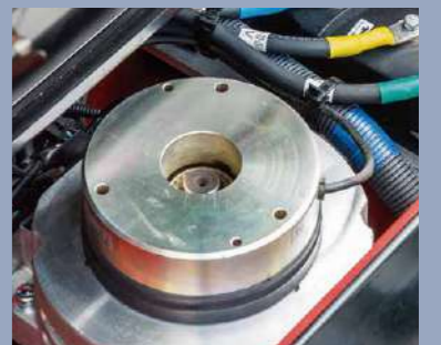
Electrical Park Brake (EPB) system