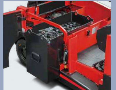
Battery side roll out is taken as the standard configuration in order to easily and fast replace the battery