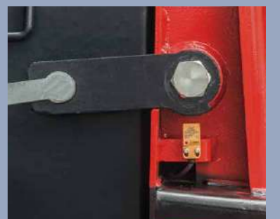
The locking device of the battery is provided with the safety protection function. Only if the locking device is rotated in place, the tractor can travel